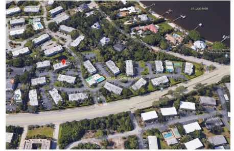
Built in 1969 - 140 units - 2 floors

Cedar Point Village 1-5 Association Inc Address: 2929 Southeast Ocean Blvd Clubhouse #1, Stuart, FL 34996 Phone: 772-286-9987 http://www.cpvillage1-5.com/