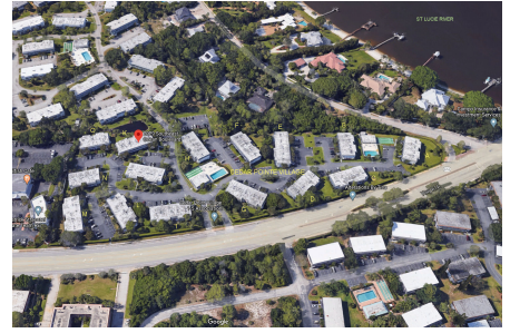
Built in 1969 - 140 units - 2 floors

Cedar Point Village 1-5 Association Inc Address: 2929 Southeast Ocean Blvd Clubhouse #1, Stuart, FL 34996 Phone: 772-286-9987 http://www.cpvillage1-5.com/