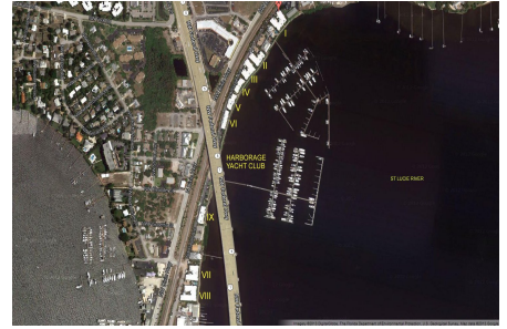
Built in 2006 - 126 units - 4 floors

Harborage Yacht Club & Marina 955 N.W. Flagler Ave. Stuart, FL 34994 (772) 692-4000 harborageyachtclub.com http://loggerheadstuart.com/