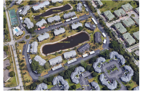
Built in 1985 - 80 units - 2 floors

Indian Pines Condominium Eight Association Inc 3011 SE Aster Lane Apartment 801 Stuart, FL 34994 (772) 287-8080