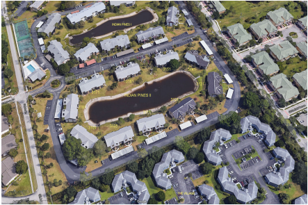
Built in 1985 - 80 units - 2 floors

Indian Pines Condominium Eight Association Inc 3011 SE Aster Lane Apartment 801 Stuart, FL 34994 (772) 287-8080