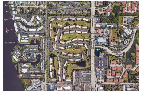
Built in 1971 - 510 units - 2 floors

King Mountain Condominium Association 1991 SW Palm City Rd, Stuart, FL 34994 (772) 283-8963