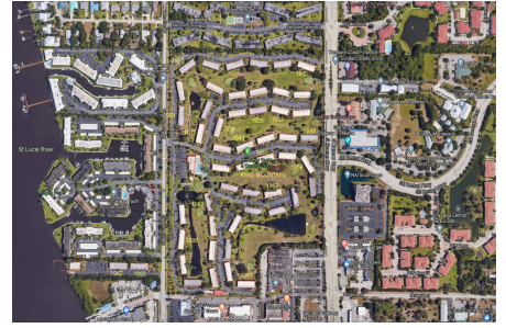
Built in 1971 - 510 units - 2 floors

King Mountain Condominium Association 1991 SW Palm City Rd, Stuart, FL 34994 (772) 283-8963