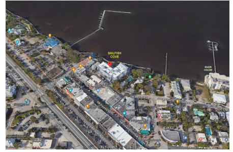
Built in 2023 - 38 units - 4 floors

Sailfish Cove Association Address: 41 SW Seminole St. Stuart, FL 34994 Phone: 772-631-6084 Email: coasailfishcove@gmail.com https://www.sailfishcovestuart.com/