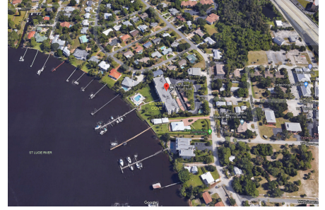
Built in 1981 - 32 units - 4 floors

SUNSET COVE CONDOMINIUM ASSOCIATION, INC Addresses: 625 N River Dr, Stuart, FL 34994 PO Box 1863, Palm City, FL 34991 1930 Commerce Ln, Jupiter, FL 33458