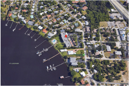
Built in 1981 - 32 units - 4 floors

SUNSET COVE CONDOMINIUM ASSOCIATION, INC Addresses: 625 N River Dr, Stuart, FL 34994 PO Box 1863, Palm City, FL 34991 1930 Commerce Ln, Jupiter, FL 33458