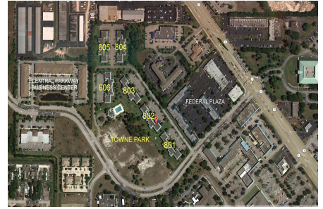
Built in 1983 - 96 units - 2 floors

Towne Park North Condominium Asso 801 SE Central Pkwy Stuart, FL 34994 (772) 463-9200