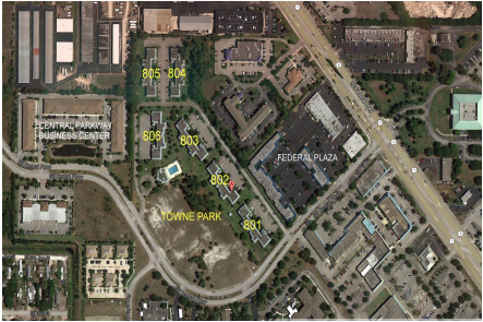
Built in 1983 - 96 units - 2 floors

Towne Park North Condominium Asso 801 SE Central Pkwy Stuart, FL 34994 (772) 463-9200