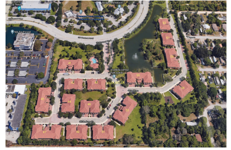
Built in 2006 - 132 units - 2 floors

Villabella Central Park Condominium Association 41 Se Sedona Circle Stuart, FL 34994 (772) 221-1144