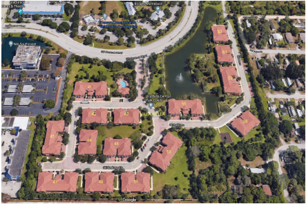
Built in 2006 - 132 units - 2 floors

Vilabella Central Park Condominium Association 41 Se Sedona Circle Stuart, FL 34994 (772) 221-1144