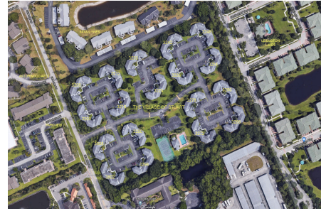
Built in 1982 - 144 units - 2 floors