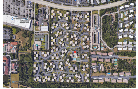
Built in 1970 - 522 units - 2 floors

Vista Pines Condominium Association Address: 2600 SE Ocean Blvd, Stuart, FL 34996 Phone: +1 772-283-4198 https://www.vistapines.com/