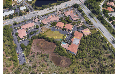
Built in 2004/2009 - 27 units - 3 floors

Willoughby Crescent Community Association Management office 772-286-0030 https://www.willoughbycrescent.com/