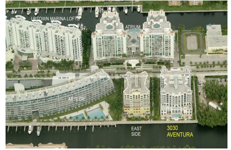
Built in 2008 - 45 units - 8 floors