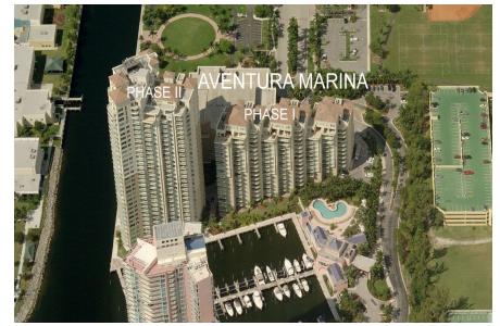
Built in 2005 - 126 units - 17 floors

Aventura Marina One Condominium Association Inc 305-705-1499