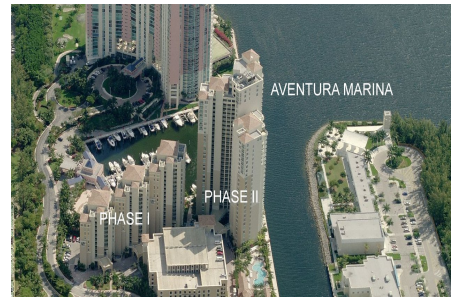
Built in 2006 - 252 units - 32 floors

Aventura Marina 2 Condominium Association Inc 305-932-3749 http://www.aventuramarina2.com