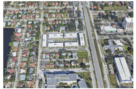
Built in 2015/2018 - 82 units - 4 floors

Aventura Place 2604 NE 213 St Aventura, FL33180 305.466.2364 http://www.liveataventuraplace.com/