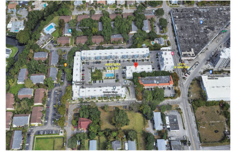
Built in 2020 - 114 units - 6 floors

Aventura Village Address: 19380 NE 26th Ave, Miami, FL 33180 Phone: +1 954-865-8122