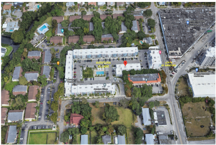
Built in 2020 - 114 units - 6 floors

Aventura Village Address: 19380 NE 26th Ave, Miami, FL 33180 Phone: +1 954-865-8122