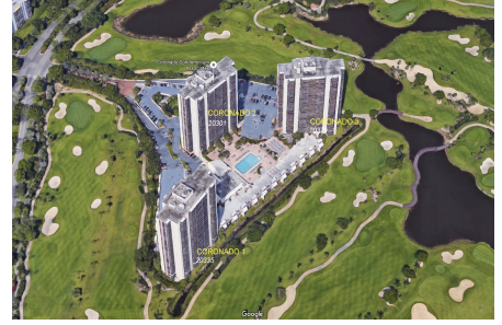
Built in 1975 - 250 units - 27 floors

Coronado Condominium Association Address: 20301 W Country Club Dr, Aventura, FL 33180, Phone: +1 305-931-5900 http://csimsi.ahn01.com/coronadofl/outside_home.asp