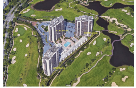
Built in 1975 - 272 units - 27 floors

Coronado Condominium Association 20301 W Country Club Dr Aventura, FL 33180 Phone number (305) 931-5900 http://csimsi.ahn01.com/coronadofl/outside_home.asp