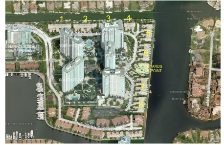
Built in 1994 - 60 units - 2 floors

Courtyards at The Point Aventura Association 21125 Yacht Club Drive Aventura, FL 33180 Phone: (305) 466-8379