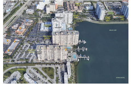
Built in 1971 - 307 units - 20 floors

Plaza Del Prado Condominium Association Address: 18071 Biscayne Blvd, Aventura, FL 33160 Phone: +1 305-931-5643 Plaza Del Prado Condominium Association 18051 Biscayne Blvd Aventura, FL 33160 +1 305-931-3544