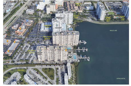
Built in 1971 - 313 units - 20 floors

Plaza Del Prado Condominium Association Address: 18071 Biscayne Blvd, Aventura, FL 33160 Phone: +1 305-931-5643 Plaza Del Prado Condominium Association 18071 Biscayne Blvd Aventura, FL 33160 (305) 682-7952 +1 305-931-3544