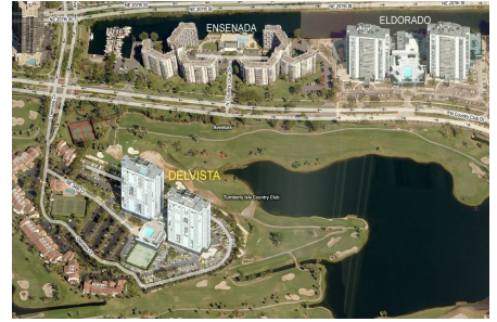
Built in 1982 - 432 units - 27 floors

Del Vista Towers Condominium (305) 937-0188