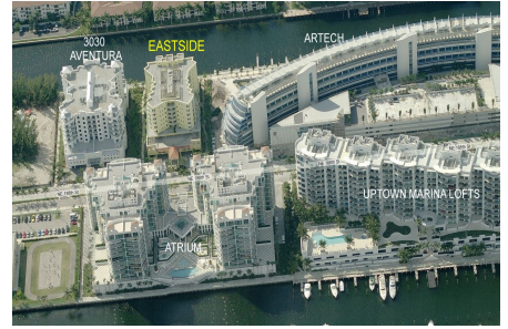
Built in 2007 - 39 units - 8 floors