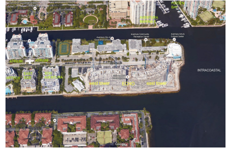
Built in 2015 - 190 units - 11 floors

Echo Aventura Address: #305, 3250 NE 188th St, Aventura, FL 33180 Phone: 786-383-1553