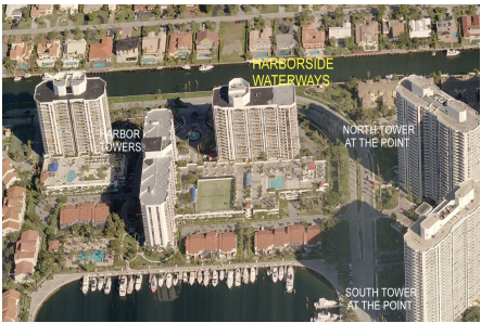
Built in 1991 - 181 units - 19 floors