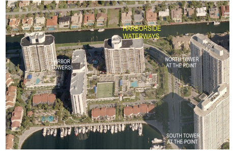
Built in 1991 - 181 units - 19 floors