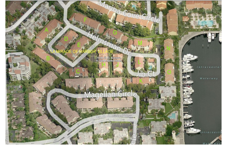
Built in 1986 - 87 units - 2 floors

LA MIRAGE OF HARBOR VILLAGE CONDOMINIUM ASSOCIATION, INC. 5445-5511 W 22 CT HIALEAH, FL 33016