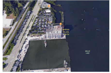
Built in 2015 - 234 units - 25 floors

Marina Palms Yacht Club & Residences Address: 17201 Biscayne Blvd, North Miami Beach, FL 33160 Phone: +1 786-629-9670