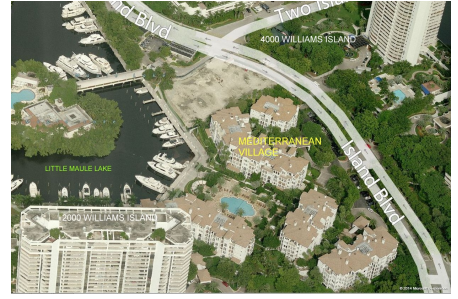
Built in 1988 - 37 units - 5 floors

Mediterranean Village Master Associates Inc, 3700 Island Blvd Aventura, FL 33160 (305) 937-7898 (305) 937-7897 (305) 936-5799 (305) 932-0804 3500 Island Blvd, Aventura, FL 33160 (305) 932-0476