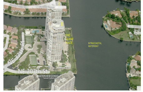
Built in 1991 - 112 units - 30 floors

One Island Place 3801 NE 207th St Miami, FL 33180 Phone: (305) 931-0793