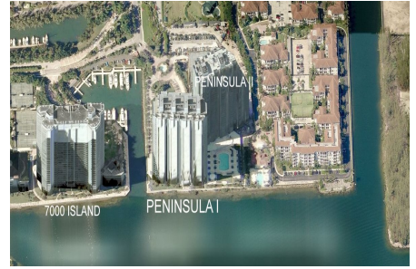
Built in 2003 - 221 units - 30 floors

The Peninsula Condominium Association Inc (305) 682-4000