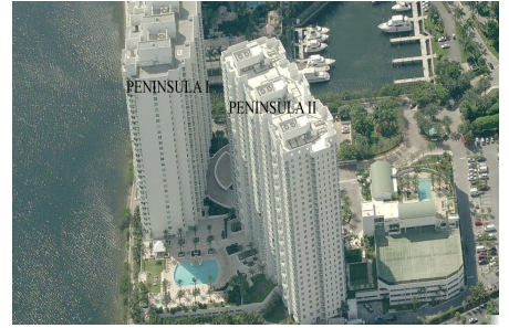
Built in 2007 - 223 units - 30 floors