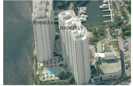
Built in 2007 - 223 units - 30 floors