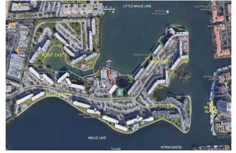
Built in 1968 - 312 units - 6 floors

Number of units: 312 Number of active listings for rent: 2 Number of active listings for sale: 8 Building inventory for sale: 2% Number of sales over the last 12 months: 11 Number of sales over the last 6 months: 4 Number of sales over the last 3 months: 0