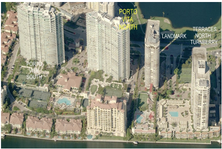
Built in 2003 - 122 units - 30 floors

Porto Vita Property Owner Association Inc (305) 933-1630