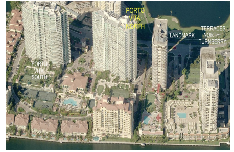
Built in 2003 - 122 units - 30 floors

Porto Vita Property Owner Association Inc (305) 933-1630