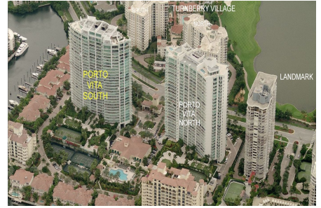
Built in 2000 - 150 units - 25 floors

Porto Vita Property Owner Association Inc (305) 692-1920