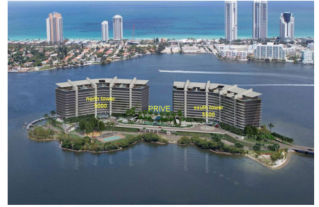
Built in 2017 - 160 units - 15 floors