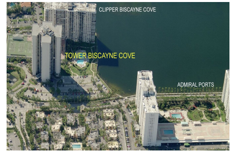
Built in 1981 - 262 units - 27 floors