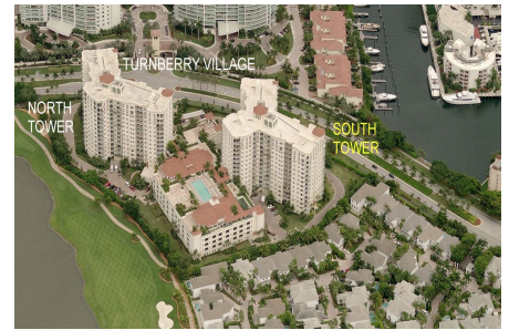
Built in 2007 - 219 units - 14 floors

Turnberry Village Condominium Association (305) 692-7538