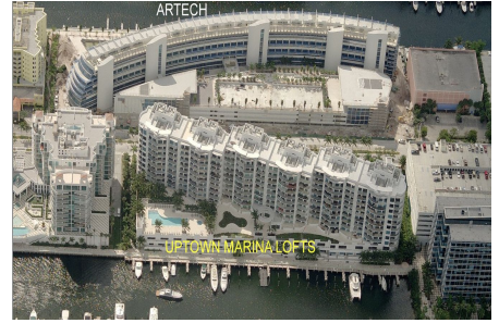
Built in 2006 - 216 units - 11 floors

Number of units: 216 Number of active listings for rent: 5 Number of active listings for sale: 9 Building inventory for sale: 4% Number of sales over the last 12 months: 6 Number of sales over the last 6 months: 1 Number of sales over the last 3 months: 1