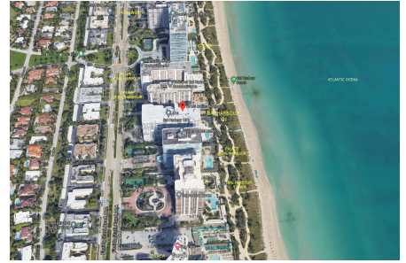
Built in 1978 - 171 units - 20 floors

Bal Harbour 101 Condominium Association Inc 10155 Collins Ave APT 205 Miami, FL, 33154-1617 (305) 868-7616