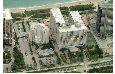
Built in 1977 - 423 units - 20 floors

Balmoral Balmoral Condominium Association Incorporated 305-866-7792 http://balmoralcondos.org