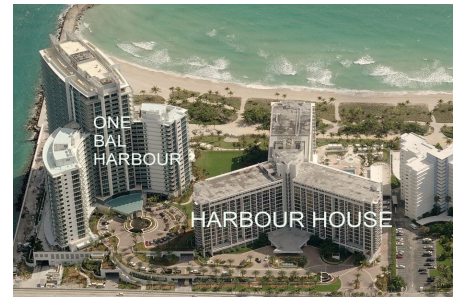
Built in 1984/2007 - 451 units - 15 floors