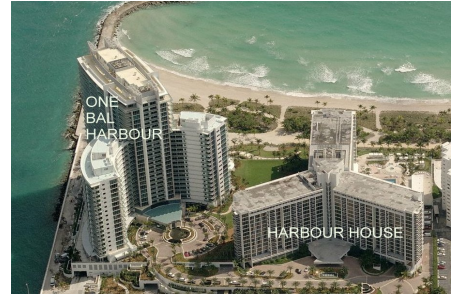
Built in 2007 - 309 units - 25 floors

One Bal Harbour 10275 Collins Ave, Bal Harbour, FL33154 (305) 865-4700