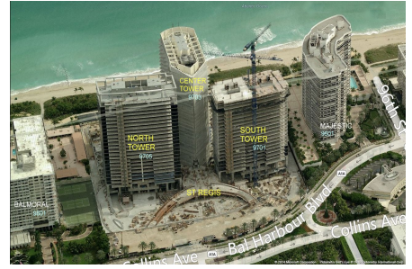
Built in 2011 - 108 units - 27 floors

St Regis Condominium Association 9500 W Bay Harbor Dr Bay Harbor Islands, FL 33154 (305) 864-1084