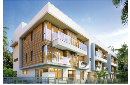
Built in 2016 - 12 units - 4 floors

Number of units: 12 Number of active listings for rent: 0 Number of active listings for sale: 0 Building inventory for sale: Number of sales over the last 12 months: 0% Number of sales over the last 6 months: 0 Number of sales over the last 3 months: 0