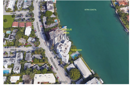
Built in 2016 - 17 units - 9 floors