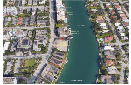
Built in 2017 - 40 units - 9 floors

The Ivory Residences Address: 9261 E Bay Harbor Dr, Bay Harbor Islands, FL 33154 Phone: +1 786-864-1326 http://www.theivoryresidences.com/