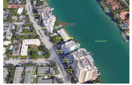
Built in 2017 - 41 units - 9 floors

O Residences 9821 E. Bay Harbor Drive, Bay Harbor, Miami, 33154 info@obayharbor.com (786) 275-6035