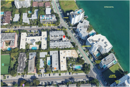
Built in 2019 - 14 units - 4 floors