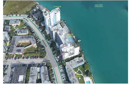
Built in 2016 - 38 units - 7 floors

10201 E Bay Harbor Dr Bay Harbor Islands, Florida 33154 +1 786-725-3646