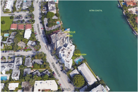
Built in 2016 - 17 units - 9 floors