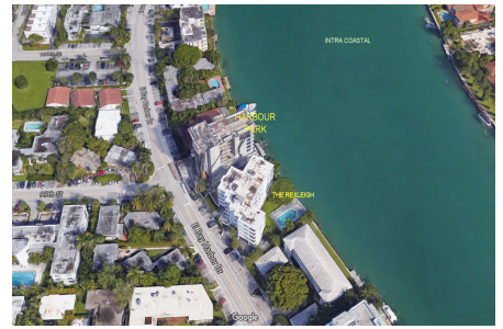
Built in 2016 - 17 units - 9 floors